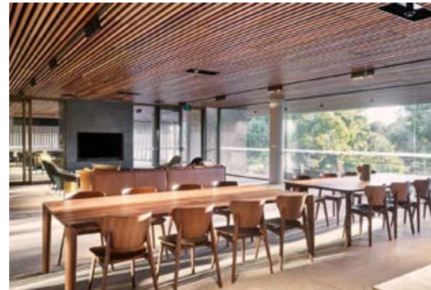
CLOCKWISE FROM LEFT: Eden Floreat, Lumiere South Perth, Riviere Residences Applecross